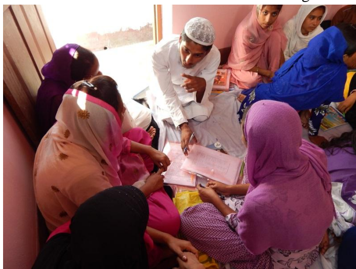
Creative energies, spirited discussions in full display at Bihar Workshop

While this exchange is initiated by the Writing Skill Development Workshops , it pans out as a continuing forum for discussion and learning. This provides a viable platform for sharing of development perspectives amongst workshop participants. A Whatsapp group created in Bihar has knit them even more closely.