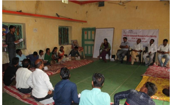
Participants interact with CEO, Zila Panchayat, media persons at Dabhara, Chhattisgarh

They gradually establish linkages on their own merit. This fuels their growth as writers who are concerned about bringing a change in the ground situation through the media.