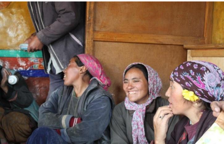
Women in Ladakh: Keeping tradition alive, moving towards change

In an age driven by information and technology, Charkha believes that the agency of youth, particularly women should be strengthened. It is important that their perspectives inform the public and influence policy makers. This approach has