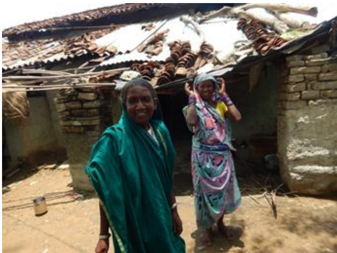
Too little is known about what rural communities lack or need

It is this voice of poor and marginalised communities, a large section of whom live in rural areas that Charkha seeks to amplify through the mainstream media in order to reach policy-making forums.