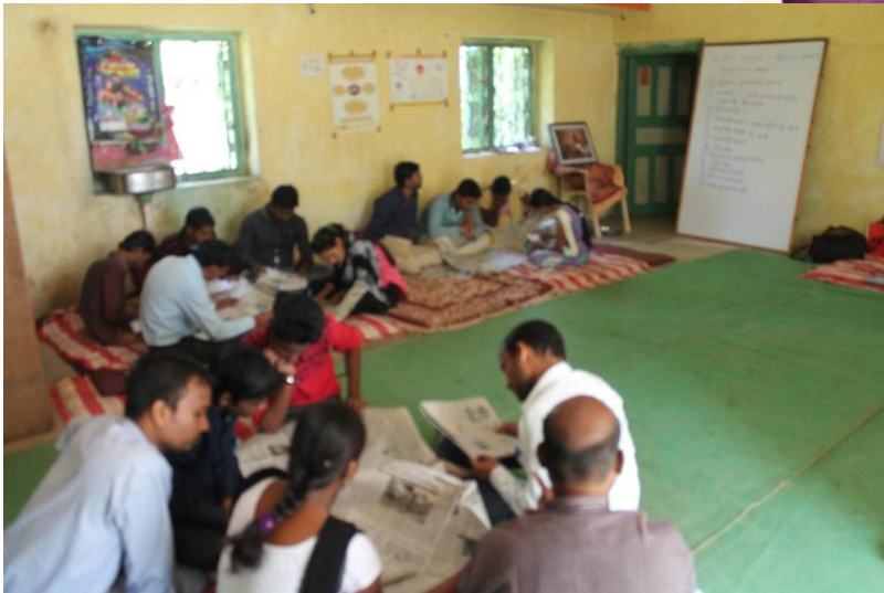
Eager to learn, to absorb: Participants at Chhattisgarh Workshop

They were gender-balanced although women participation in Bihar was much