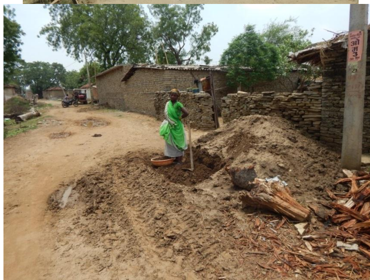
Daily life still a struggle: Dabhara block, Janjgir Champa district, Chhattisgarh