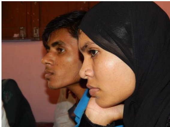
Workshops set the tone for a continued interaction between Charkha and participants

Nurturing a pool of community-based young writers and social advocates