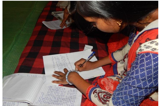
The moving finger: Participant at Chhattisgarh Workshop

Being the sowing season for wheat, it was also a busy time. For most participants coming from agricultural families, it was tough to juggle their priorities when all hands were required on the farm. Many had other