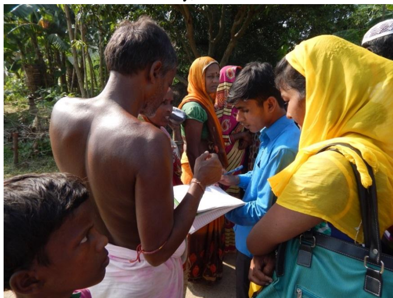
Interacting with community members: Participants on a Field Visit, Bihar

A crucial role of the Editorial team is to strengthen media contacts at the regional level. During the visits, Charkha team members slotted in time to meet the media in the respective states. This effectively opens up space in newspapers and magazines for the emerging writings from the ground.