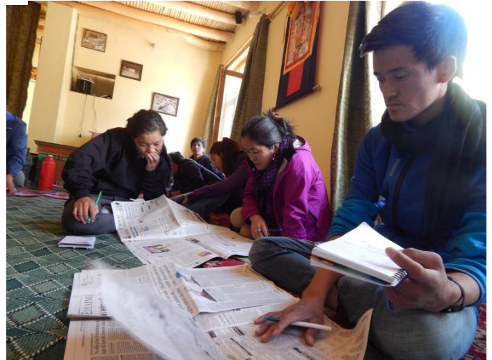
Group work: Participants scanning newspapers