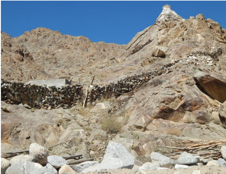
Ladakh; a difficult terrain, daunting developmental challenges

Ladakh still remains little, known beyond its natural boundaries. A high altitude desert that experiences heavy snowfall, sub-zero temperatures, it is easily among the most difficult inhabited regions in the world.