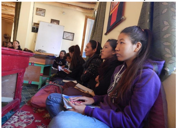
Young women in rapt attention at the workshop