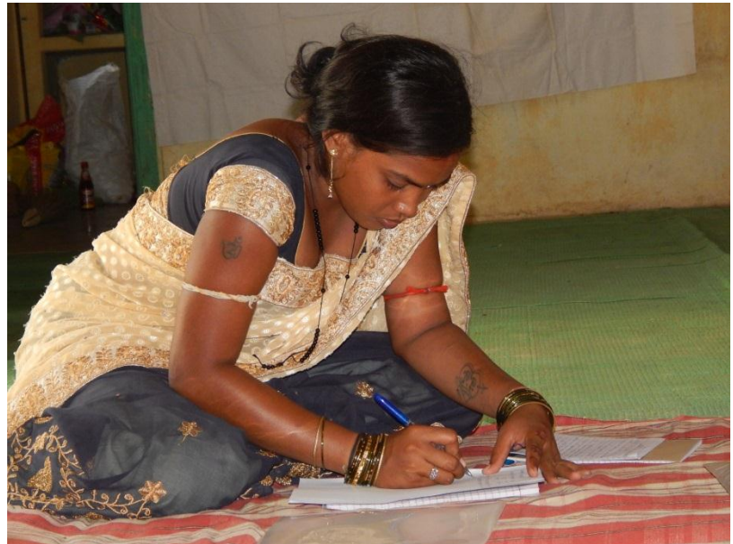
Charkha's work on the field: Transforming a rural participant into a writer of social issues

Media advocacy driven by grassroots concerns is indeed a powerful tool to bring about this change. It is in this space that Charkha sees its continuing role.